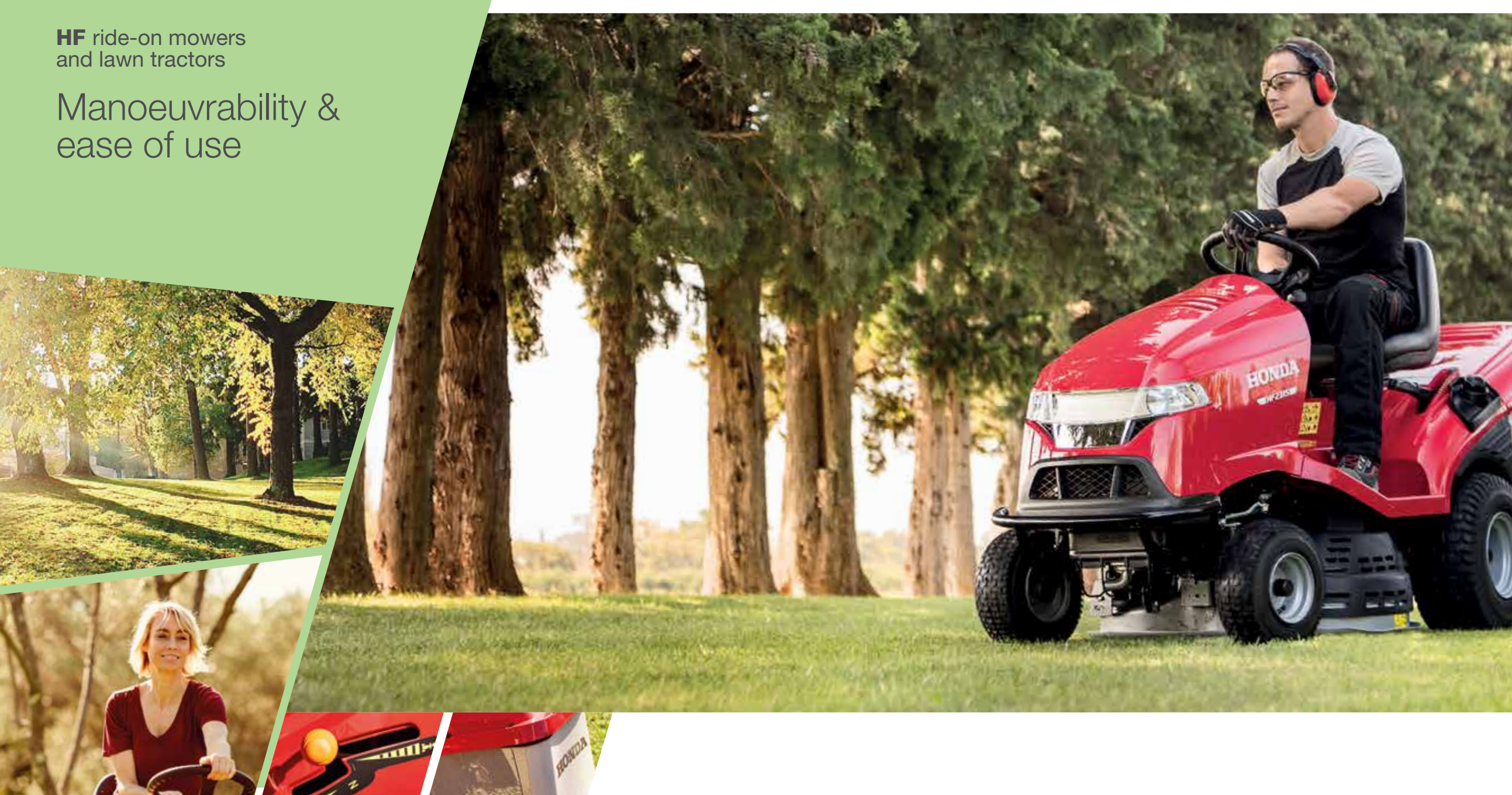
Hydrostatic transmission for an incomparable user experience optimised collection capacity